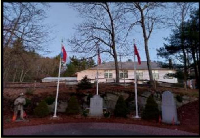
Front view of the Memorial with the pillar with the founding fathers listed on it, and on the right side of it the members who died in the line of duty.

I have visited the memorial a couple of times and they were unforgettable moments. And because the house is ours, Red Knights can stay in it during of your stay. Each time European members visit the memorial, the founding fathers try to meet us. They love to hear the stories from Europe, how we work, how we evolved there.