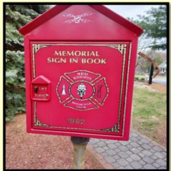
Sign in Book inside, where you can write your name and date of visit.