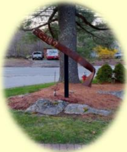
Piece of steel from the World trade Center